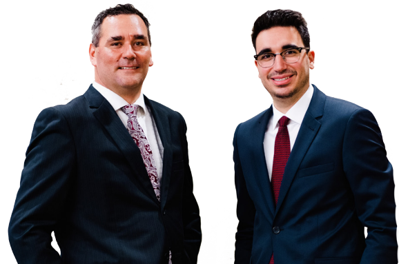
Morris Wealth Advisory Group TD Wealth Private Investment Advice